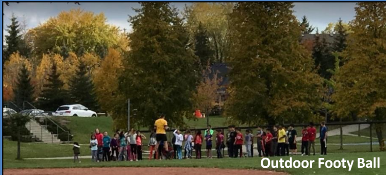
Outdoor Footy Ball