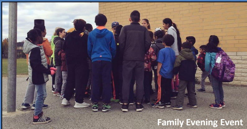
Family Evening Event

"Goodonya mate" - Energy you give off, is the energy you get back!